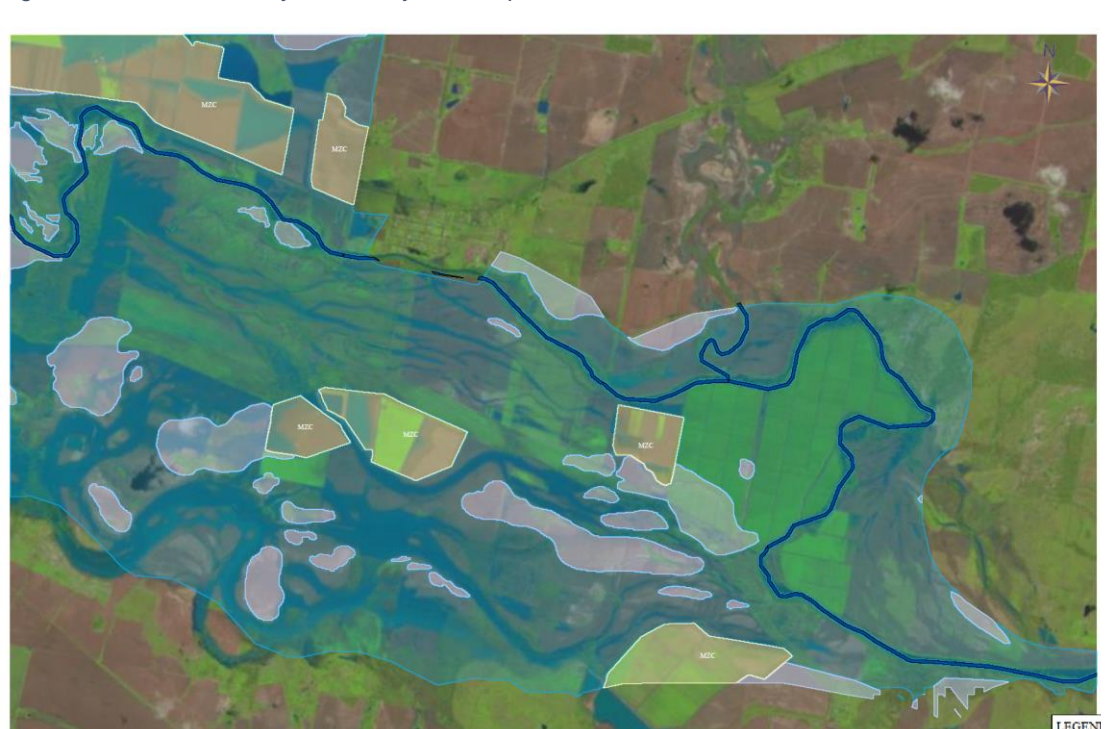
Figure 1: Eastern Boundary of the Gwydir Floodplain

As we raised in our submission to the draft FMP for the Gwydir Valley, we requested there be further smoothing of mapping and review of the minimum polygon size to address the granularity in the model outputs. This is more relevant in areas where the scale of data is different (20m resolution in central areas to 50m resolution on the outer areas as per the Background documentation) but also at the edges of the Plan, whereby boundary effects are impacting the accuracy of the locations. One example presented below in Figure 1 can be evidenced here on the Eastern floodplain and the north-western, where the zones do not align with recent flooding which occurred at lower thresholds than the reference flood.