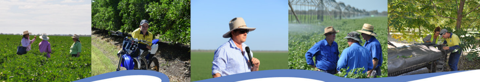
Gwydir Valley Irrigators Association Inc. making every drop count